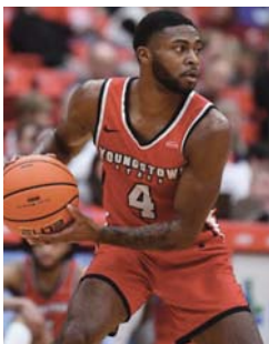
Youngstown State is set to win its first regular season title in school history.

THE WAY WE SEE IT: As has become the norm in the League, the only team from the Horizon appearing in this year's Dance will be the one cutting down the nets on March 7. Last year it was Wright State, who nipped Northern Kentucky by 1 point in the title game. It marked the 14th time in the past 15 tournaments in which the No. 1 seed failed to climb the ladder. Thus, it's an ominous spot in which YOUNGSTOWN STATE finds itself this year. Making matters worse for the Penguins, they bring a 0-4 SUATS mark into this event when coming off consecutive wins... CLEVELAND STATE captured the crown two seasons ago yet fell to the eventual champion Raiders in the second-round as a No. 1 seed last season. Despite a 3-11-1 ATS dog log in this event, the Vikings have won seven of their last ten games in this tourney and should be considered dangerous... NORTHERN KENTUCKY fell by the narrowest of margins in the title game of this tournament last season and stand 3-0 SUATS as single-digit dogs in this competition. They were 14-6 against sub