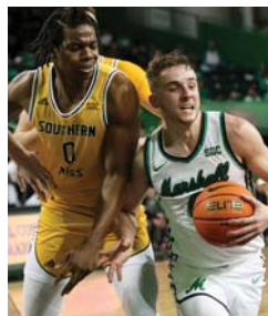
Sun Belt newcomers Marshall and Southern Miss lead the conference down the stretch.

THE WAY WE SEE IT: For the third year in a row the Pensacola Bay Center will welcome the fun-in-the-sun guys where the winner of this tournament will once again likely be another one-and-done in the Big Dance. What's really weird is last year's titleist, Georgia State, lost all five of its starters and is this year's trash collector with the Panthers looking up the conference standings at every member. Heading this year's list of wannabes is MARSHALL , one of four newcomers in the Sun Belt this season. They won only a dozen games last season but, behind returning 4 starters, were projected to finish in sixth place in the Sun Belt. The problem is they've won only one conference tourney, the CUSA in 2018, over the past 16 seasons so this will be new territory for the Herd in more ways than one... SOUTHERN MISS is also a surprise newcomer to the conference this season after winning only 7 games in the CUSA last year. They are at their best as a favorite in the CUSA tournament, going 12-3 SU and 10-5 ATS, including 11-0 SU and 9-2 ATS against avenging foes... UL LAFAYETTE welcomed 4 starters back from last year's 16-win unit and it vaulted them to a 20-plus win effort. It's one reason they were the preseason favorite to win the Sun Belt after